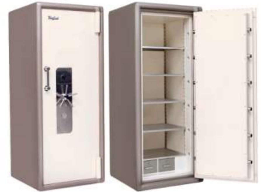
72"H x 30"W x 30"D 1550KG