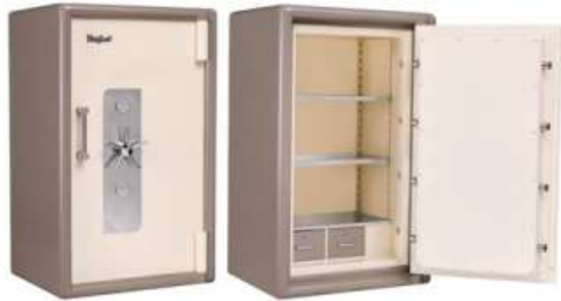
48"H x 30"W x 24"D 1000KG