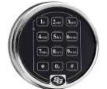
Digital Combination Lock