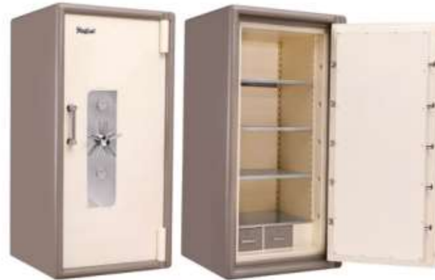
60"H x 30"W x 30"D 1350KG