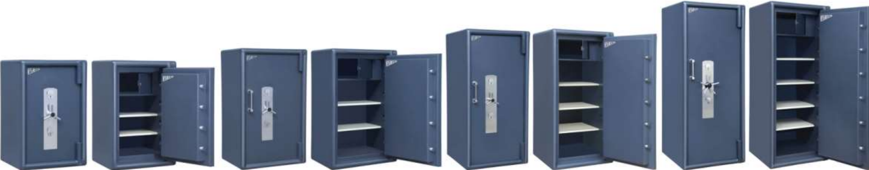
42"H x 27"W x 24"D 670KG